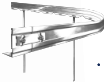
Sturdy Locking System